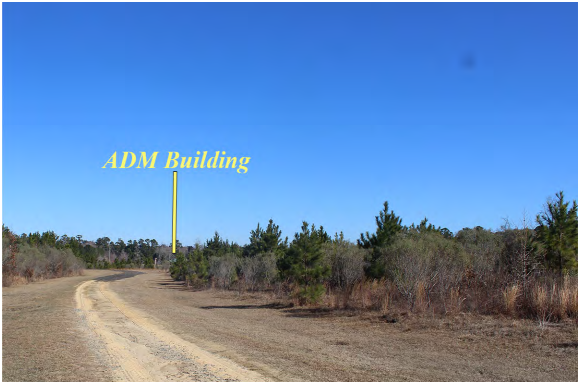
The January 2025 photo from the ranger house to dining hall.