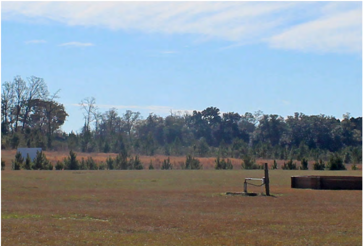
The January 2025 photo from the dining hall back to ranger house.