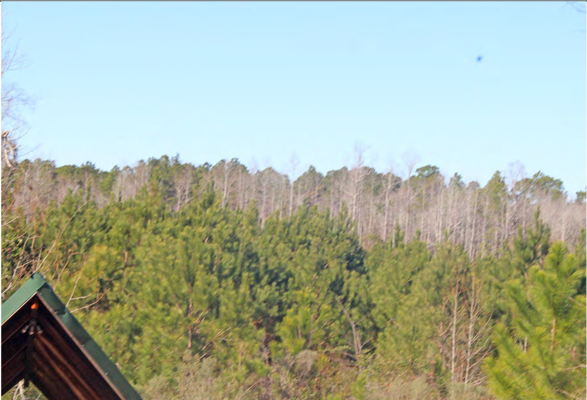
January 2025, from the Chapel back to the lake