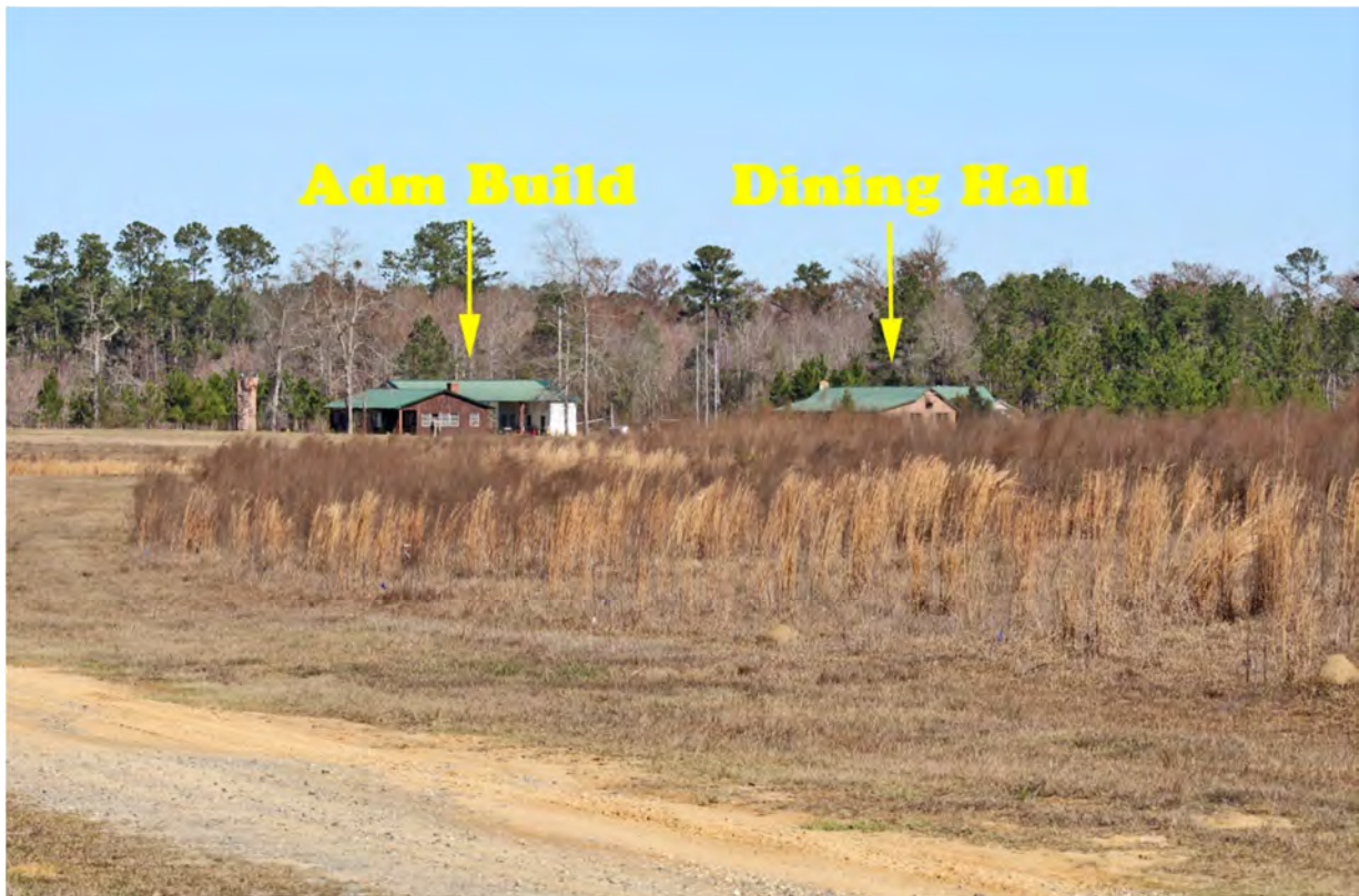
January 2020 view from the Ranger House.