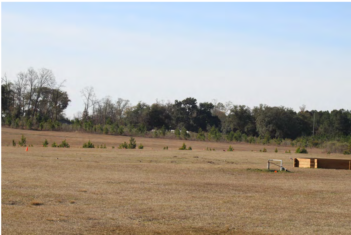
The January 2024 photo from the dining hall back to ranger house.