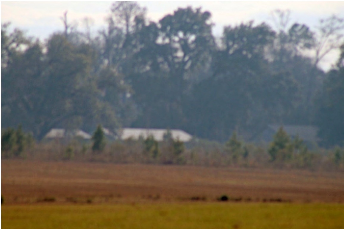
The February 2023 photo from the dining hall to the ranger house. (The day of these photos there was extensive smoke in the air from burning fields.)