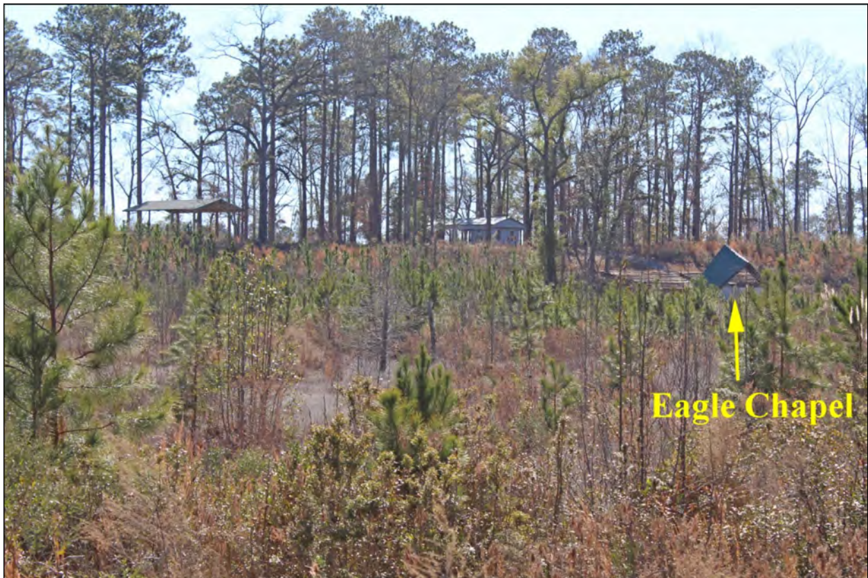
January 2021, also looking southeast from the lake and up the ridge.