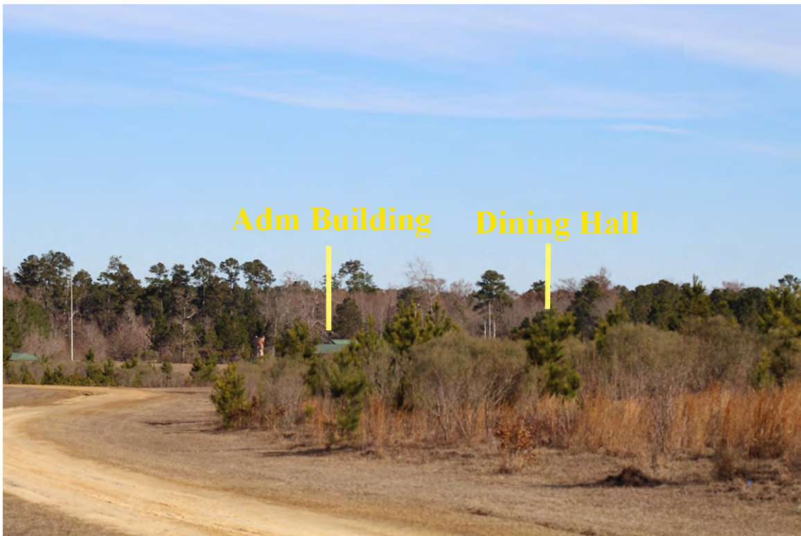
The January 2024 photo from the ranger house.