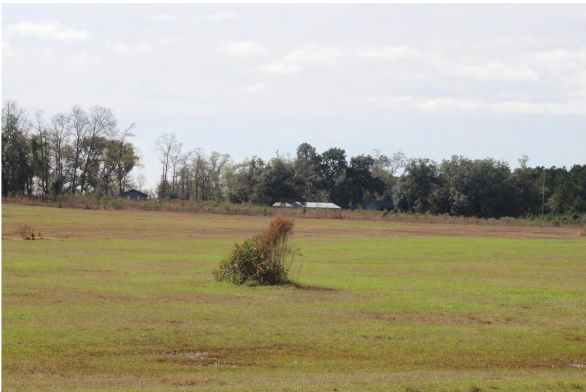
In January, 2022 a reverse view from the dining hall back toward the ranger house.