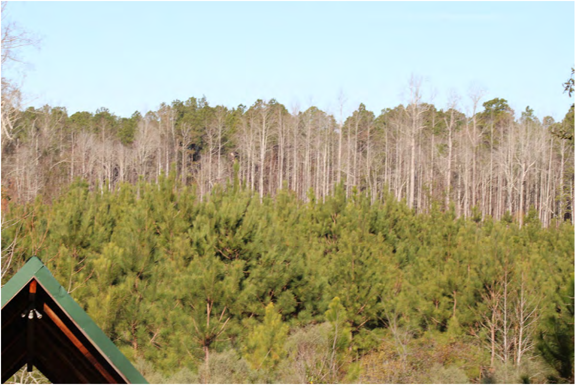
January 2024, from the Chapel back to the lake