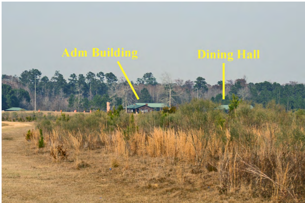
The February 2023 photo from the ranger house.