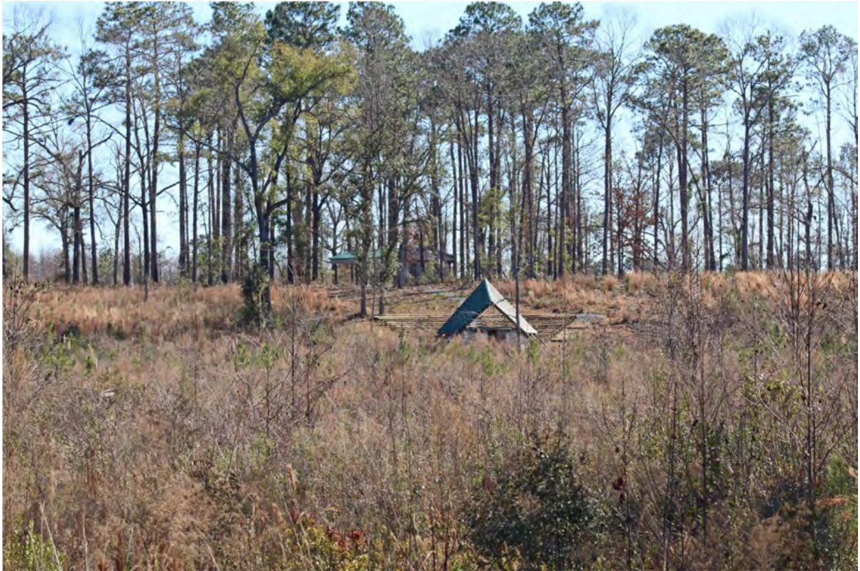
The January, 2020 photo is looking southeast from the lake and up the ridge.