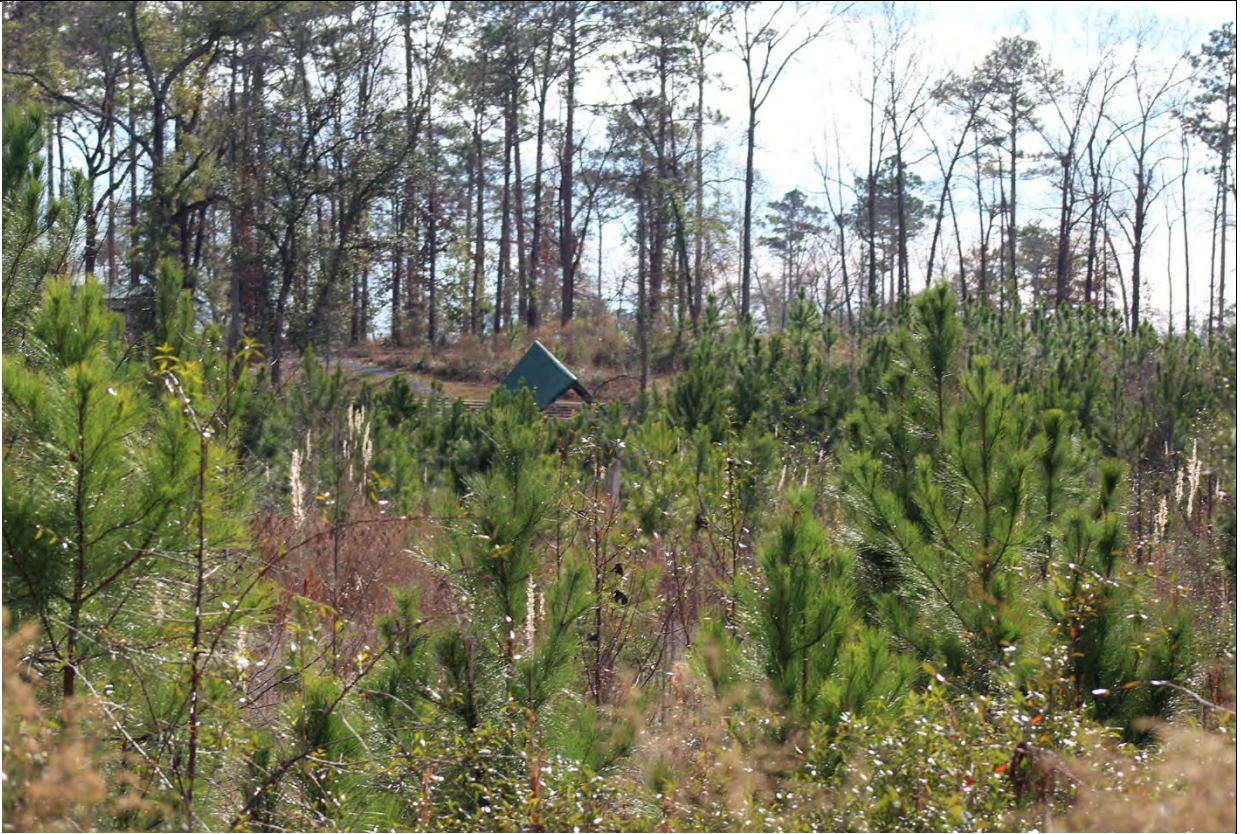
January 2022, also looking southeast from the lake and up the ridge.