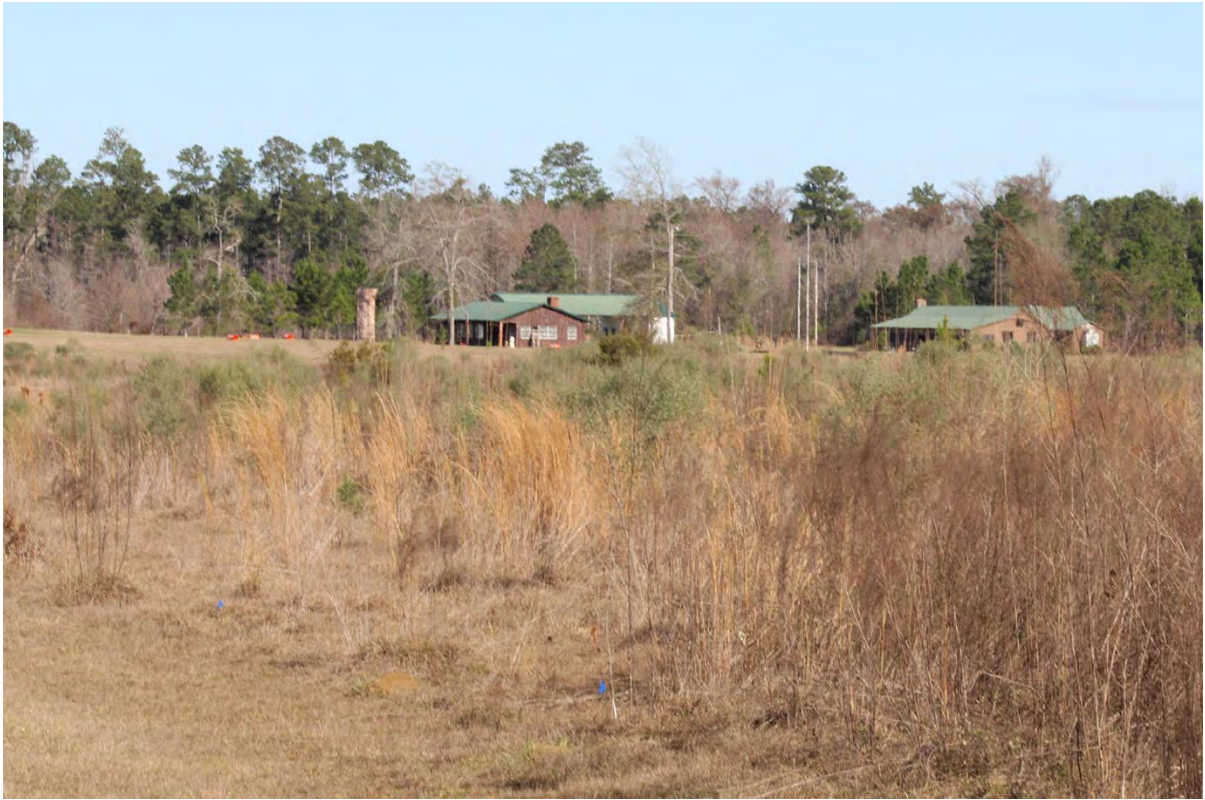
In January 2022, the trees have grown a great deal, but are hidden from this angle by the brush.