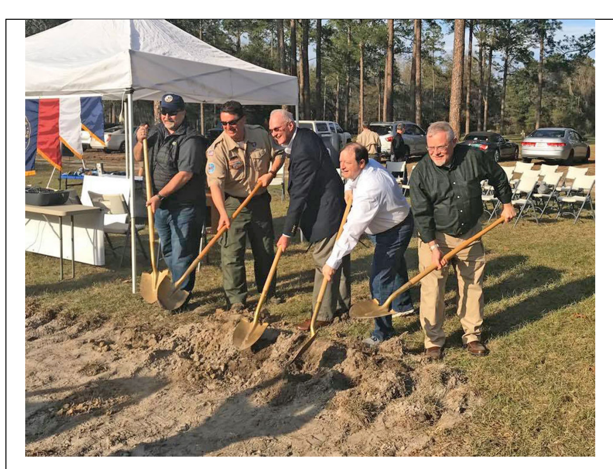
Groundbreaking February 23<sup>rd</sup>, 2020

For the 2020 Section S9 Conclave new bathroom facilities were constructed. Due to the cancellation of the Conclave, the construction was not finished until April, 2021 just before the 2021 Conclave at Camp Patten.