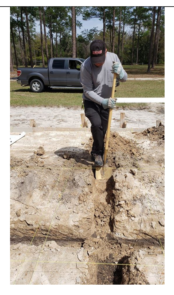
Construction on March 10, 2020