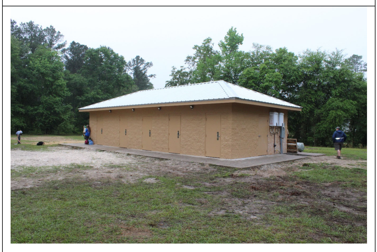
Finished in April, 2021.