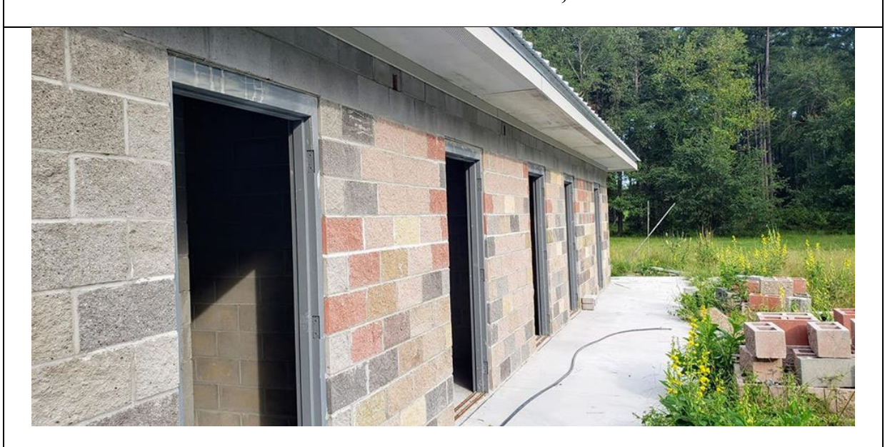
Construction on August 17, 2020