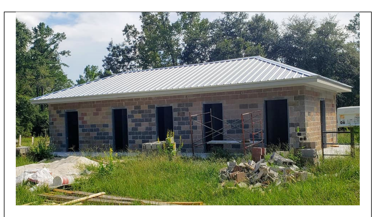
Construction on August 17, 2020