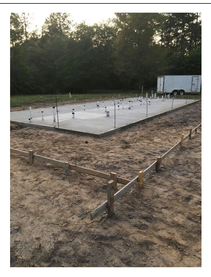
Construction on March 28, 2020