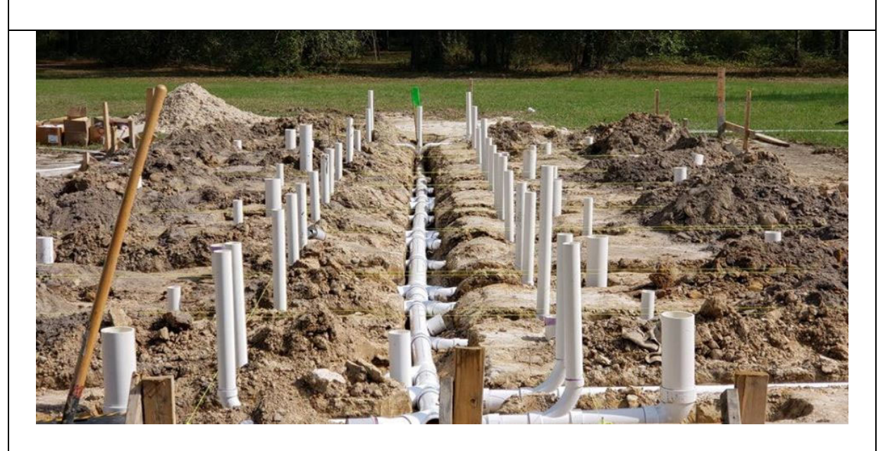
Construction on March 18, 2020