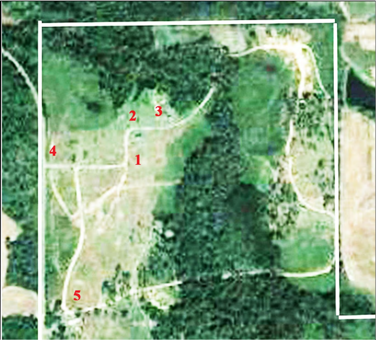
Main Camp at Camp Osborn