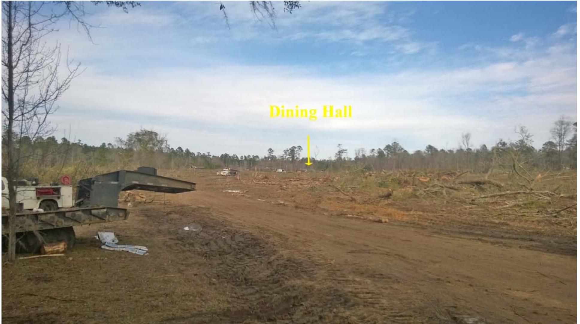
(Photo 1) The view from the gate (the Ranger house is directly behind me) looking north along the road leading past Cub World to the main camp. You can now see the dining hall in the main part of camp which is about one-half mile distance.