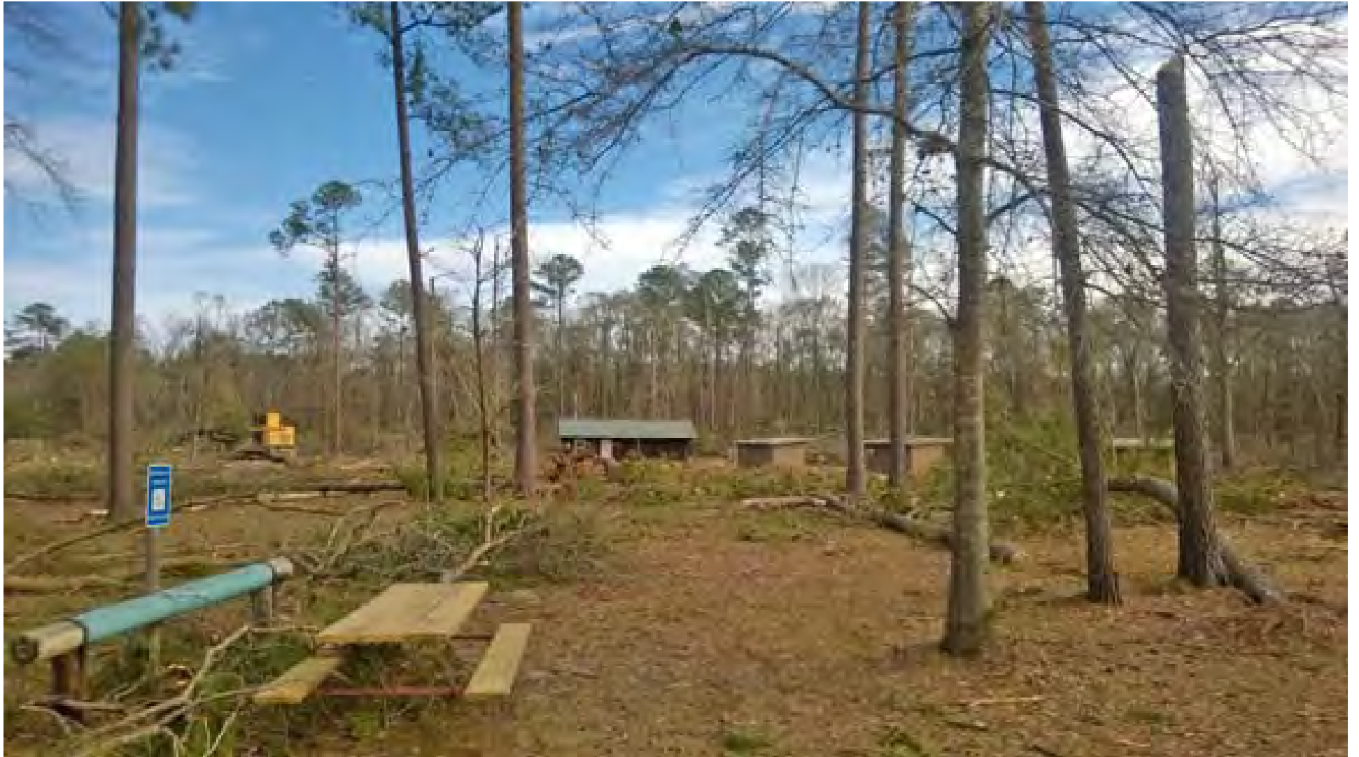
The Burrow and the old staff lien-tos as seen from the parking lot.