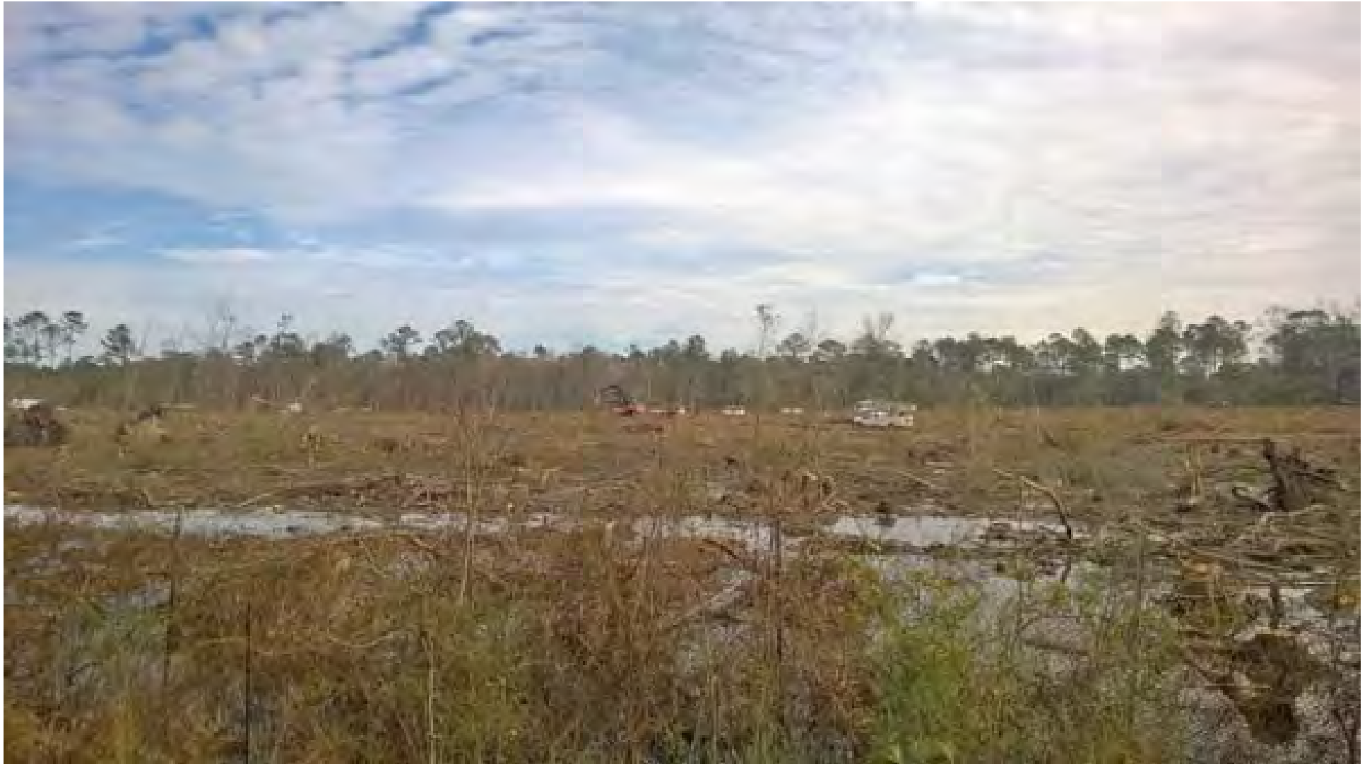
(Photo 2) Cub World as seen from outside camp on Camp Osborn Road (looking east from Camp Osborn Road). The white pickup is parked on the camp road that runs in front of the Cub World from the main gate to the main part of camp. The main part of camp can be seen to the extreme left.