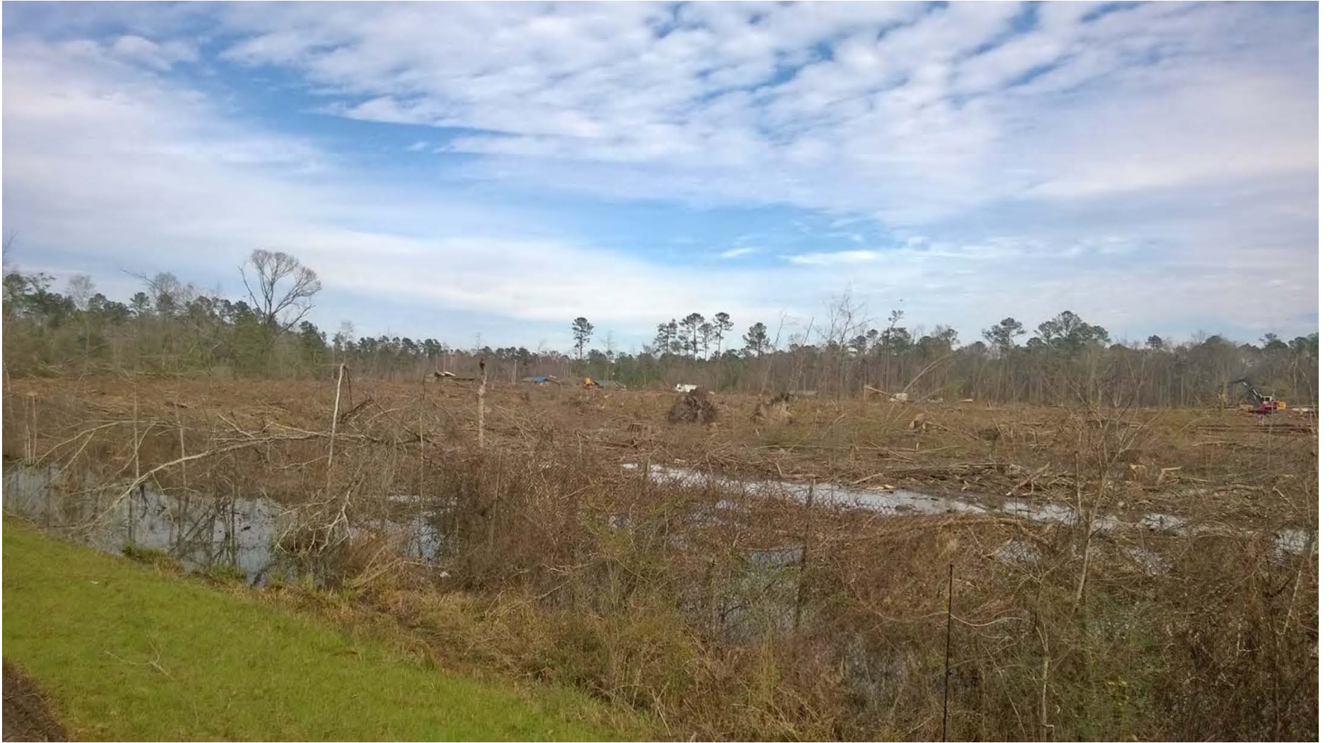
(Photo 3) First Aid, Administration Building and Dining Hall as seen from outside camp on Camp Osborn Road (Looking east from Camp Osborn Road).