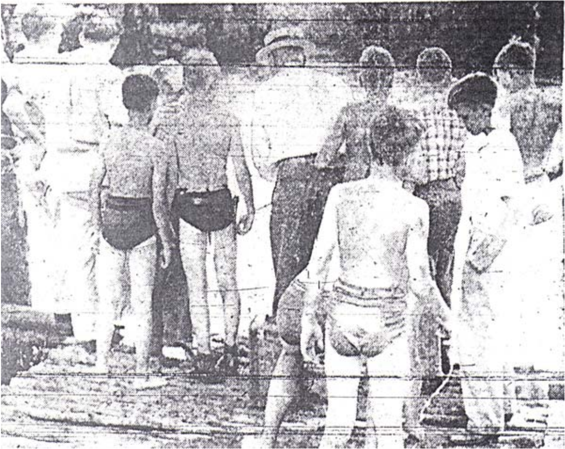
An unidentified visitor to Camp Chehaw in 1940 takes a pole and tires his hand at fishing in the Muckalee Creek.

(From June 23, 1940, The Albany Herald . Used with permission.)