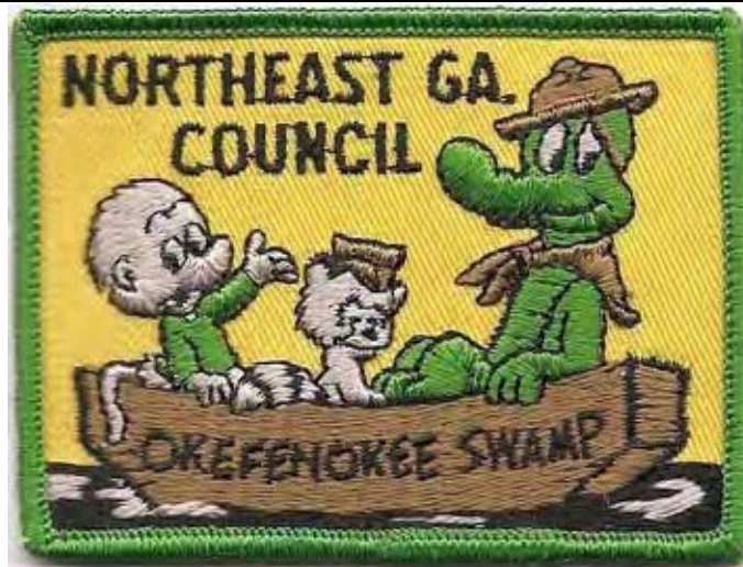
Okefenokee Swamp - No "Expedition"