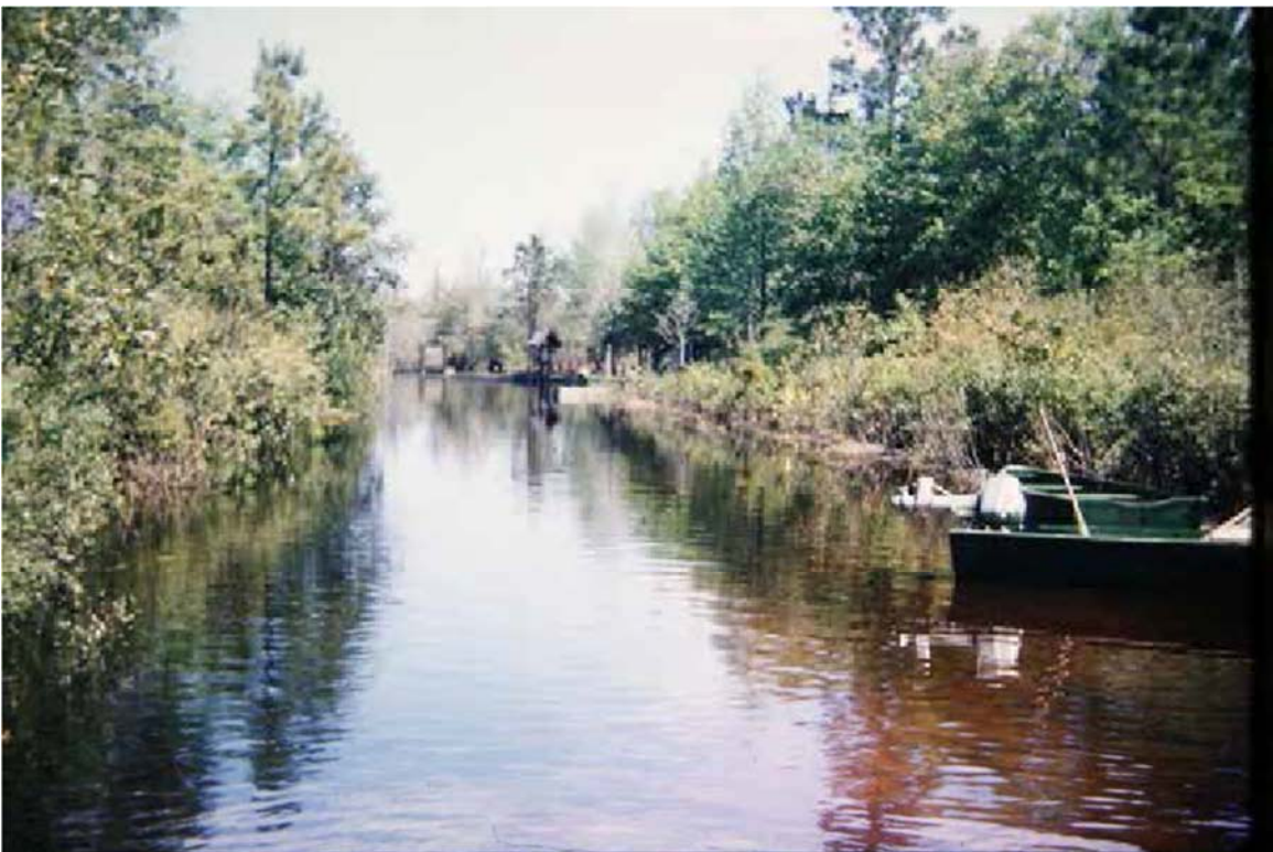
The Canal to the Suwannee River. Photo is most likely from the 1971 trip.