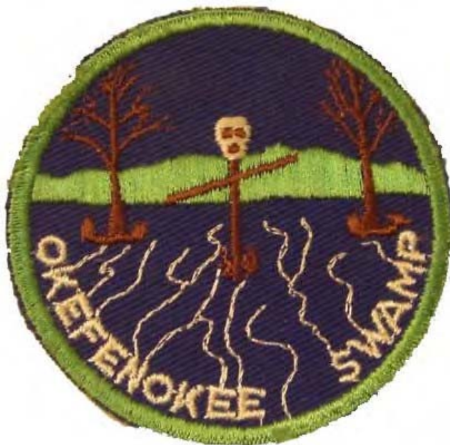
Atlanta Area Council 1950 Expedition