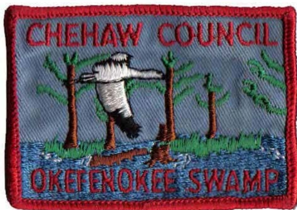
CP 102 (58mm x 82 mm, Dark Sky)

Four variations of the patch given to scouts from Chehaw Council in the 1960s and 1970s.