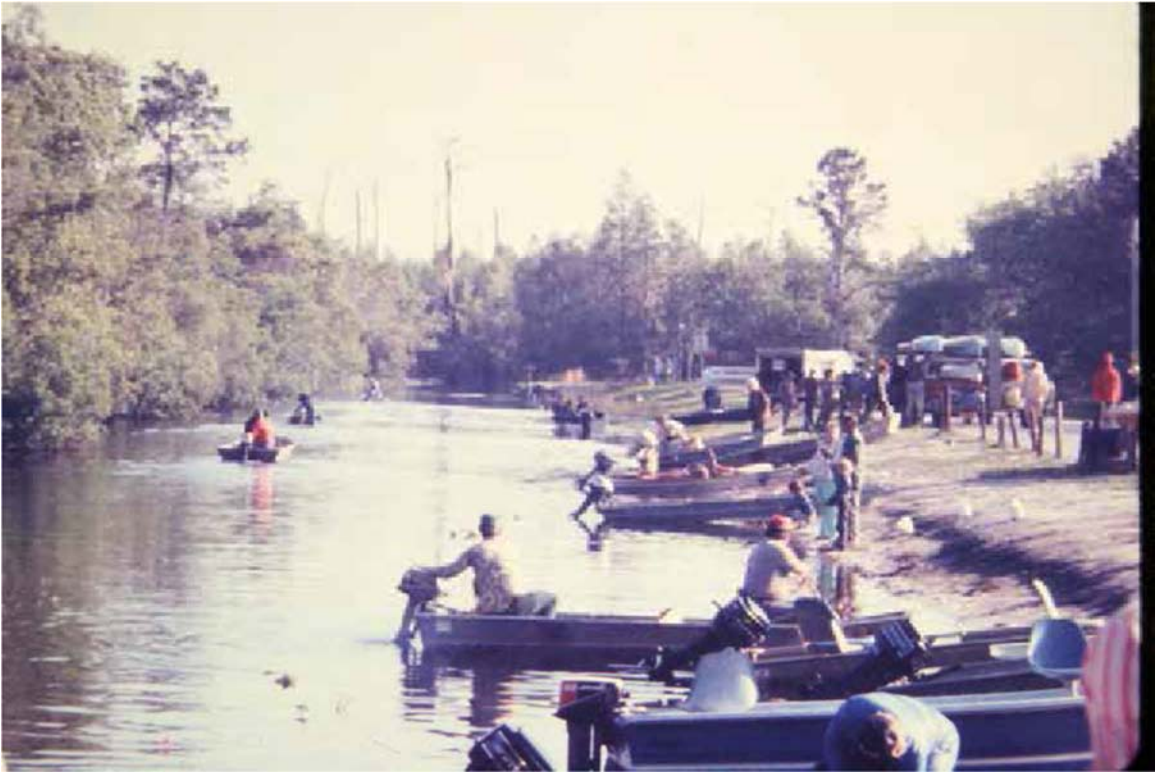
Chehaw Council launching into the Canal at Park Headquarters that led to the Suwannee River. Photo is most likely from the 1971 trip.