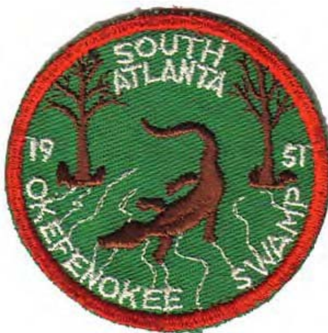
Atlanta Area Council 1951 Expedition