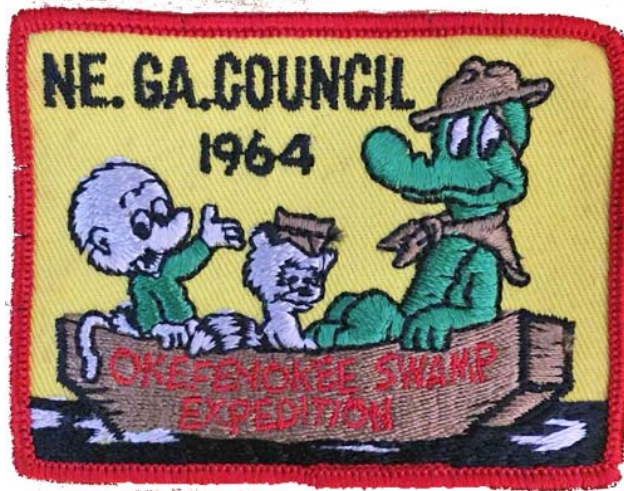
1964 Okefenokee Swamp Expedition