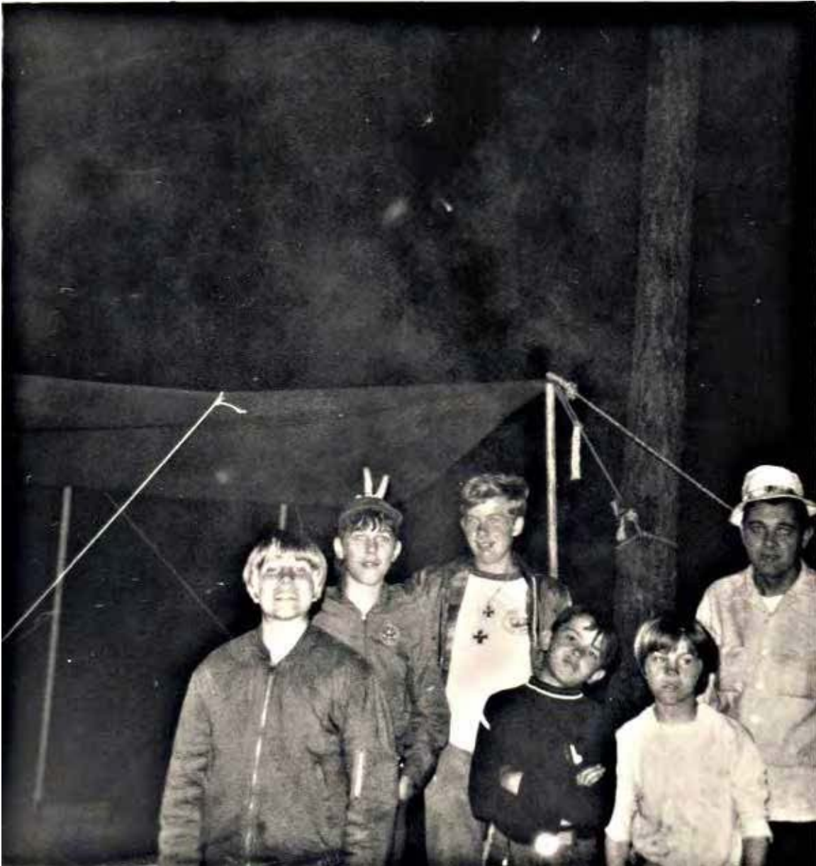
Most likely a “Coon Patrol”

Photos from Billy's Island in 1973 which was the last year that the State Park allowed camping on Billy's Island. These are photos are of Troop 20 which camped from March 22 to March 24, 1973.