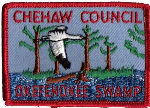
CP 102 (58mm x 82 mm, Regular Sky)