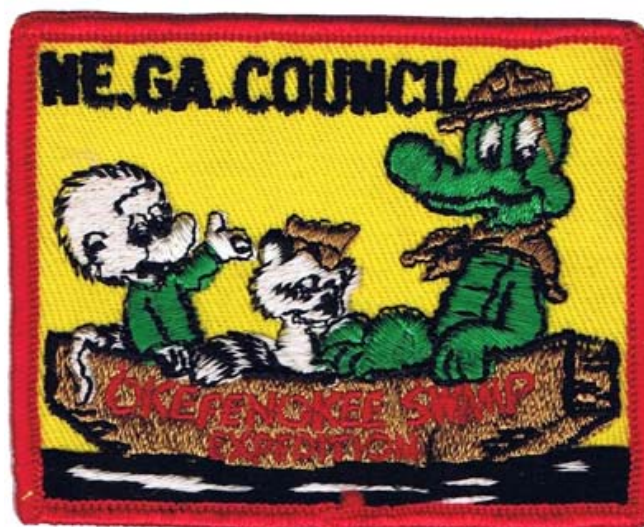
Okefenokee Swamp Expedition