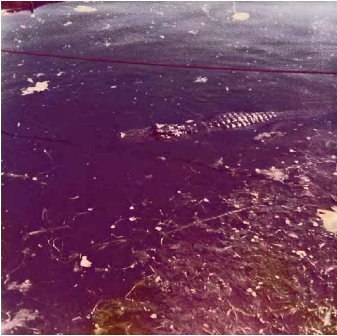
One of the thousands of gators

At night hundreds of gators could be seen in the swamp surrounding Billy's Island. Their eyes glowed orange and they grunted. The sight was one that no scout ever forgot. As there was no edge to the island - only an ever watery soil until it was nothing but water, scouts did not have to be told not to venture near the swamp edge at night. In all the writers' years of going to the swamp only a scoutmaster got lost at night.