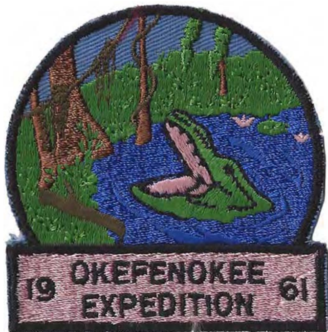
Atlanta Area Council 1961 Expedition