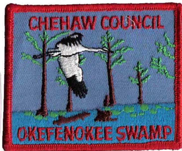
CP 103 (80mm x 97 mm) Regular Letters