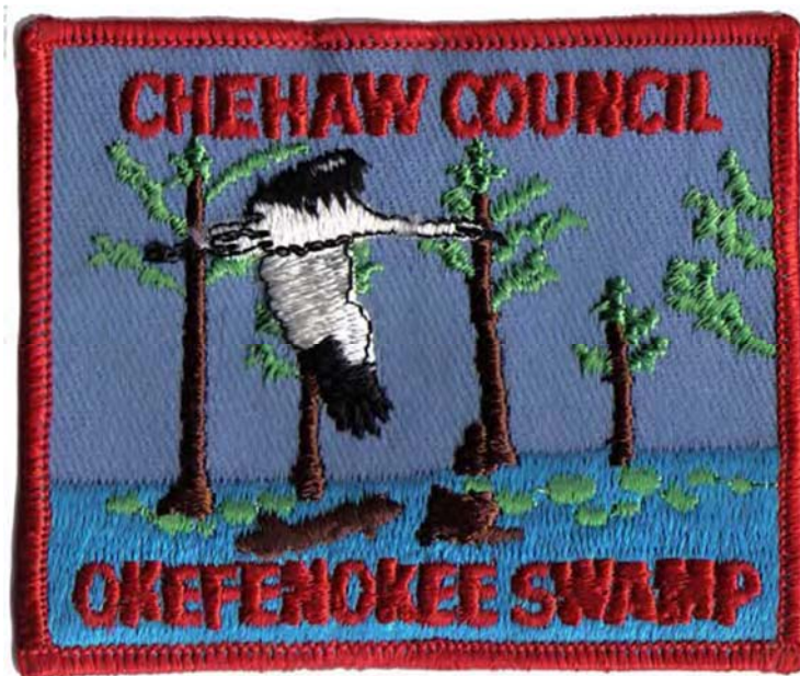
CP 103 (80mm x 97 mm) Thick Letters