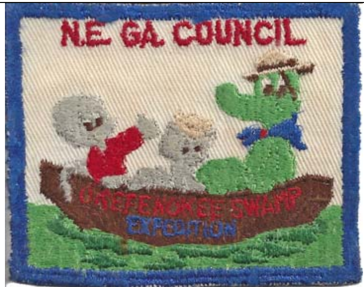
Okefenokee Swamp Expedition