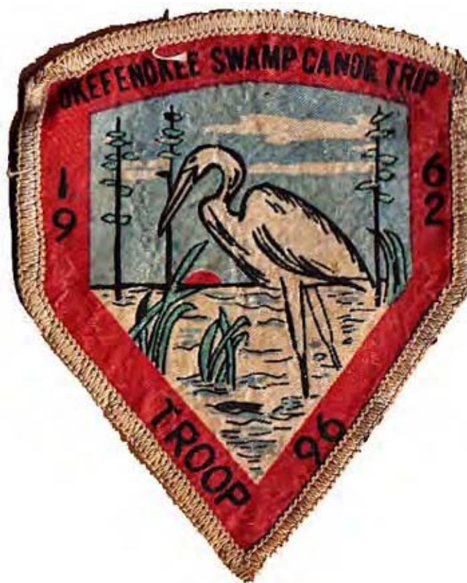
Troop 96 most likely from Central Georgia Council.