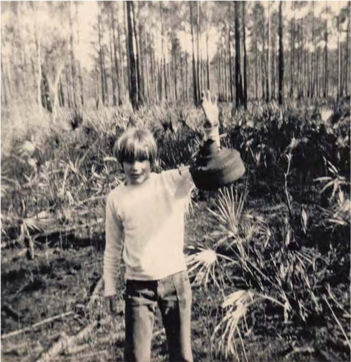
Scout is unknown.