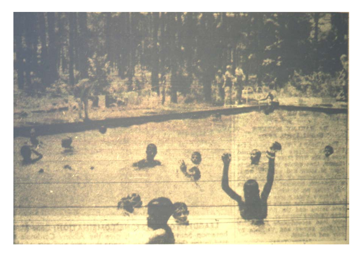
The swimming pool in 1952.