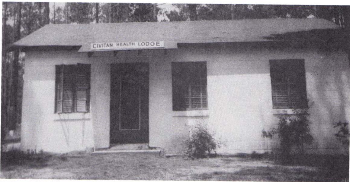
First Aid Building in the 1950s 2

June 1950 - Boy Scouts Begin Third Week Of Camp: 1 Boy Scout troops from throughout Chehaw Council are shown as they gather at Chase Osborn Scout Camp Sunday to begin the third week at Summer Camp there. Each group of Scouts attending the camp remains a week.