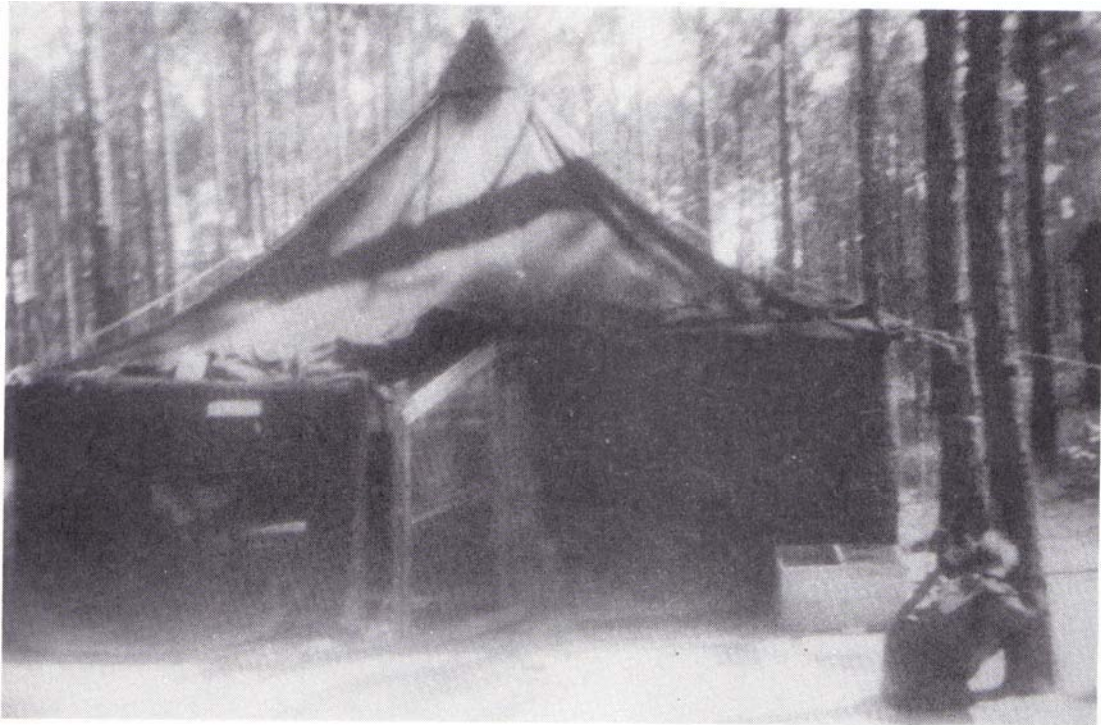
Stewart's Tent located near the original dining hall. Photo from 1952. 4