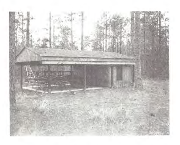
Two Program Shelters were started and one pictured has been completed.