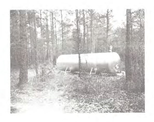
A new water system was installed which will be adequate to meet the needs of our total camp expansion program and the main camp. Picture is the new 5000 gallon water storing tank.