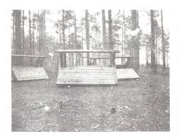
New Tent Plat . .ms were constructed for one Troop site along with 5 new Patrol tables.