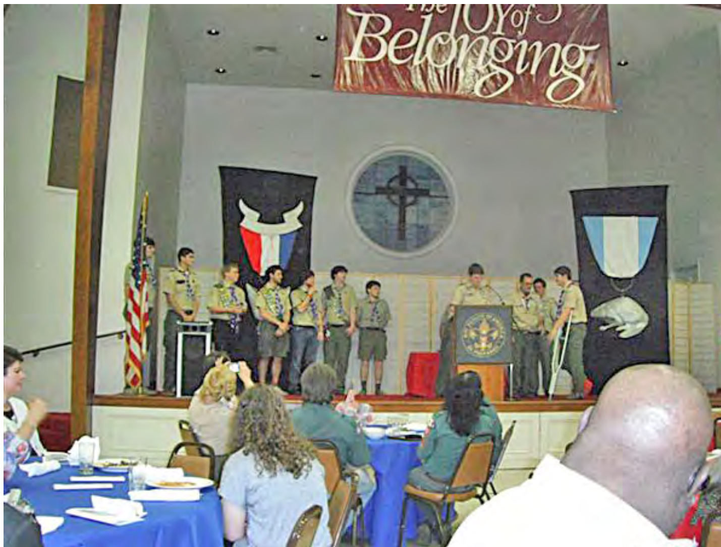
The banquet was held in March 2012 at Avalon Methodist Church, Albany.