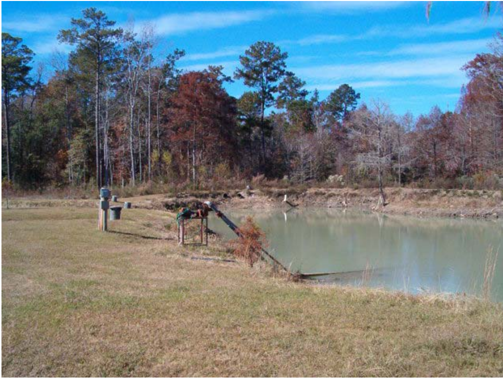
The Blue Hole