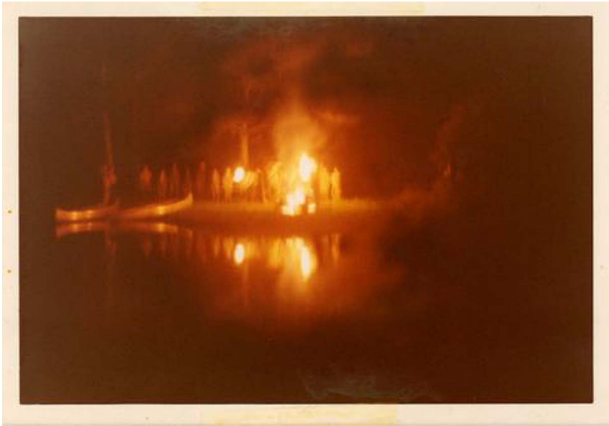
A night photo of the Blue Hole in 1971 at an OA tap-out. The photographer was standing where the audience was seated which was between the pool and the Blue Hole looking across the Blue Hole to the where the candidates were taken to be marched off into the woods.