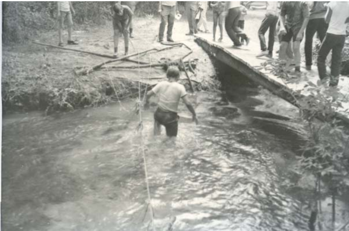
Working in the small stream that ran from Jasmine Springs to the Blue Hole. In 1970 or 1971 it flowed with clear water from Jasmine Springs which is an artesian spring or well.