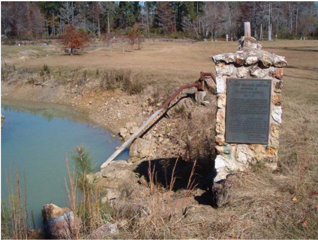
Jasmine Springs Monument