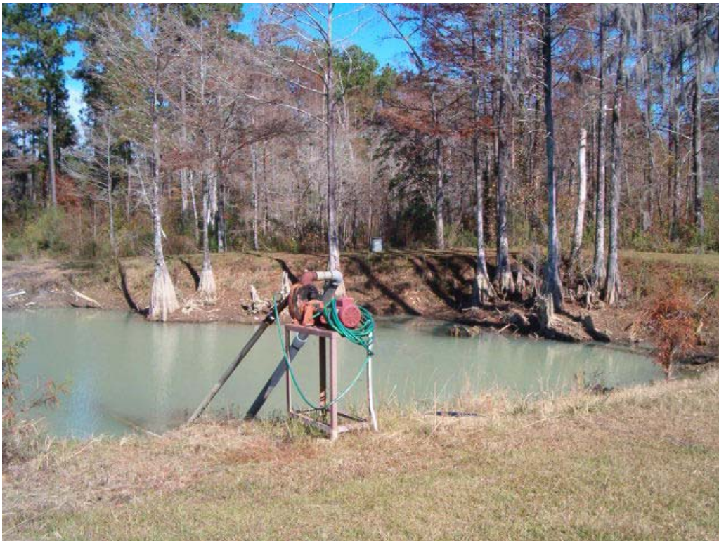
The Blue Hole