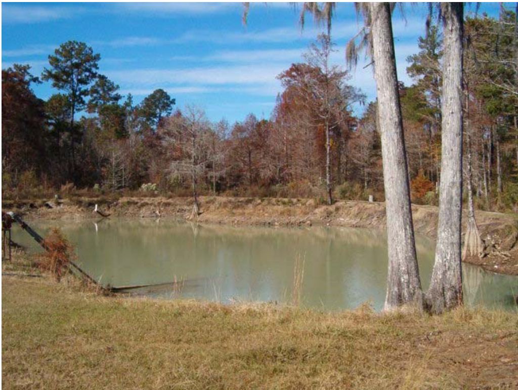
The Blue Hole