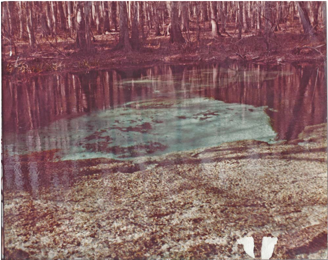
The photo was found at Possum Poke. It had no label or date on it. It is most likely The Blue Hole or the stream running from Jasmine Spring to the Blue Hole. The photo probably dates from the 1950s or early 1960s.