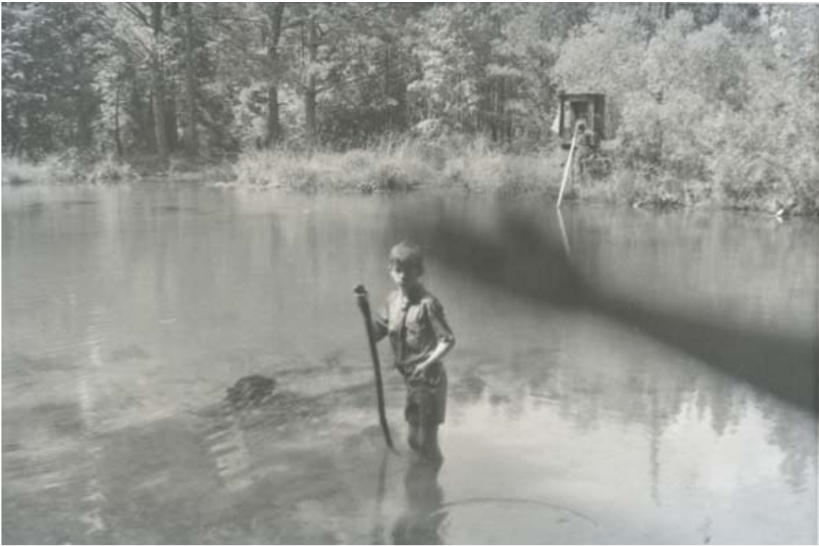
The Blue Hole in 1970 or 1971.