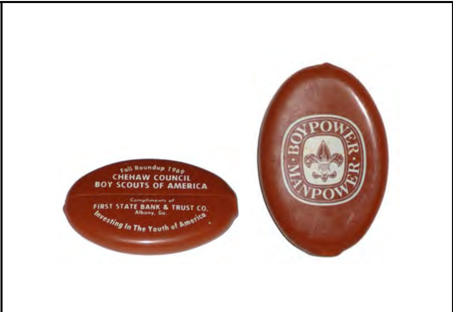
1969 Chehaw Council Fall Roundup Coin Holder