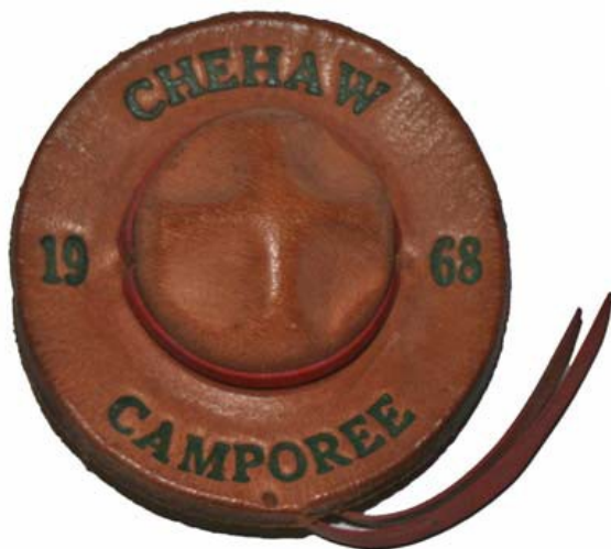
1968 Camporee Leather Neckerchief Slide