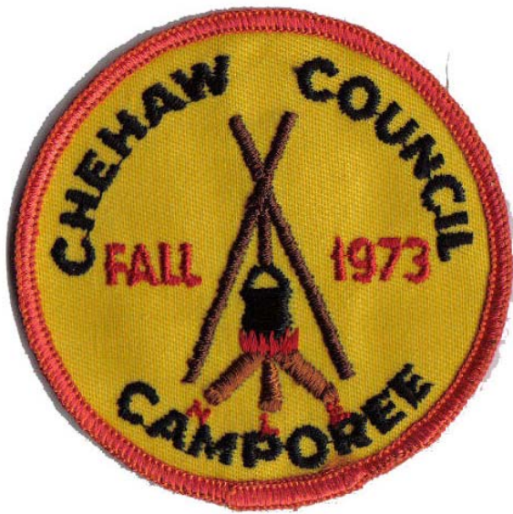
1973 Camporee patches.

The purpose of the different color backgrounds is unknown. The best guess is that each represents one of the three districts which participated in the camporee.