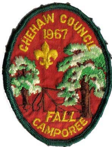
1967 Fall Camporee