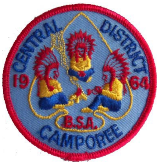
1964 Central District Camporee