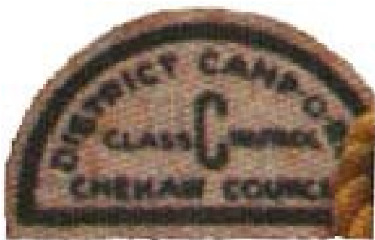
Felt patch From the early 1950s. Text is "District Camp-O-Ree / Class C Patrol / Chehaw Council"