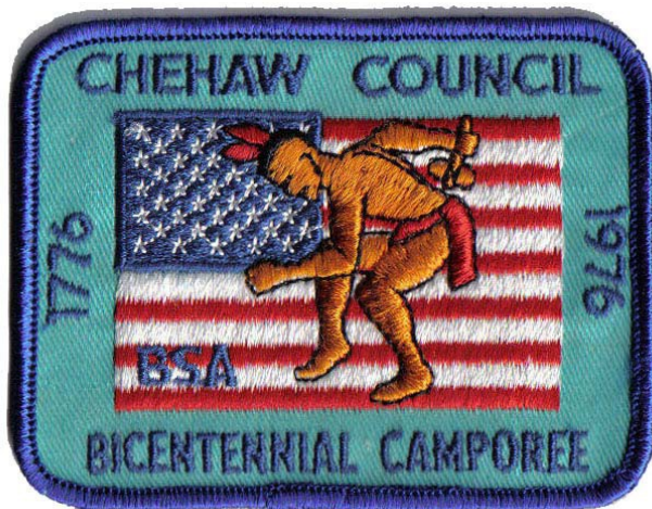
1976 One of two patches celebrating the Bicentennial.