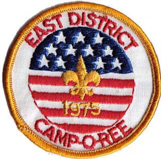
1975 District Camporee