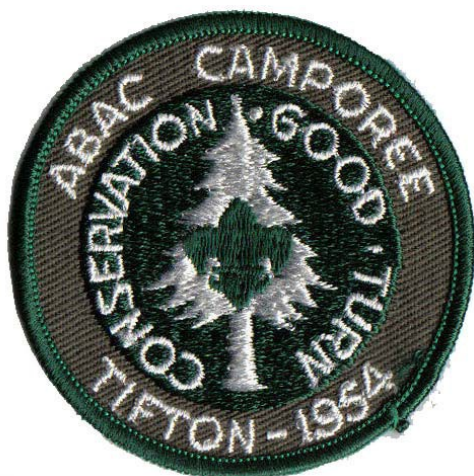
1954 Camporee held at Abraham Baldwin Ag College in Tifton, Georgia