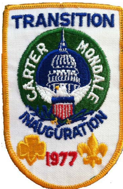
Joint Presidential Inauguration patch for Girl and Boy Scouts. President Carter was from Chehaw Council. The council's CSP S2 was in honor of President Carter.