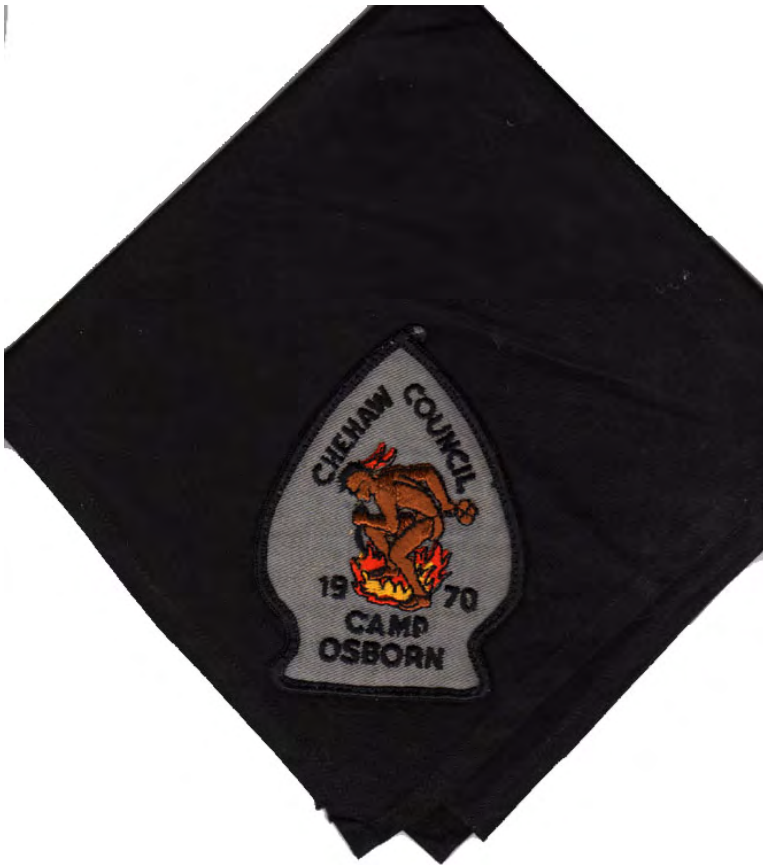
1970 1970 patch on black cloth