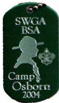
Dog tag with 24 inch chain 2004 Silver metallic. Scan color is not accurate