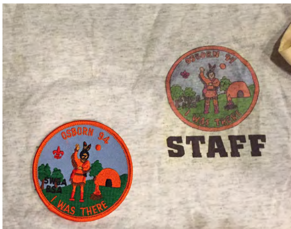
1993 Staff T-Shirt