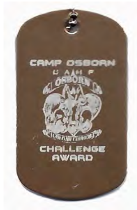
Dog tag with 24 inch chain Challenge Award 2007 or 2008 Silver metallic. Scan color is not accurate