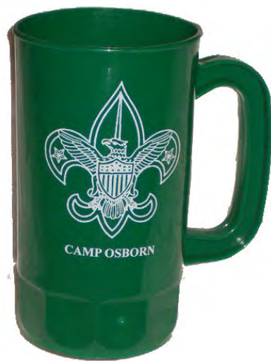
Green plastic mug from Camp Osborn. Purchased at the scout office in 2006.