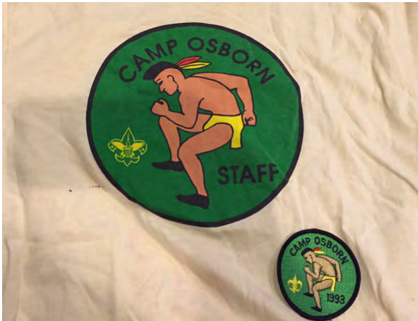
1993 Staff T-Shirt