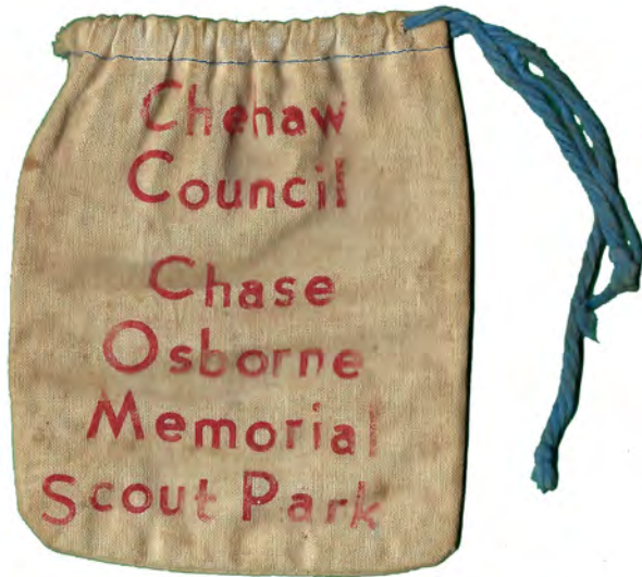
Cloth Bag Circa 1950