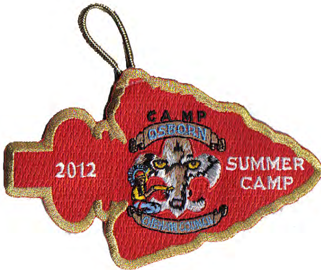
Honor Camper 2012 Summer Camp

One scout from each troop was selected by the members of his troop to receive the patch