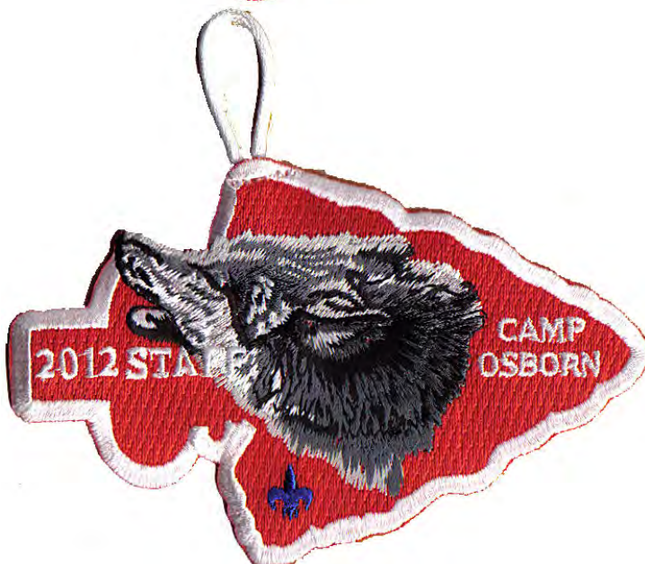
Staff 2012 Summer Camp