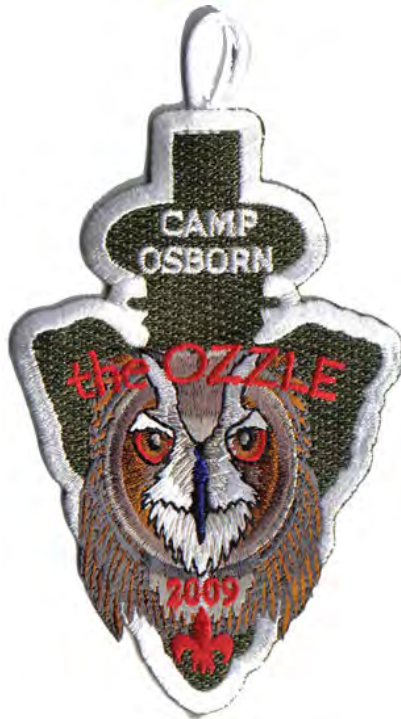
2009 The Ozzle