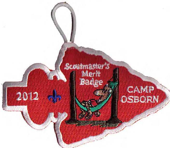
Scoutmaster's Award 2012 Summer Camp

Earned by scoutmasters who completed a set of requirements during camp.