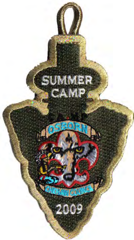
2009 Gold Border Camper Patch Issued to regular campers