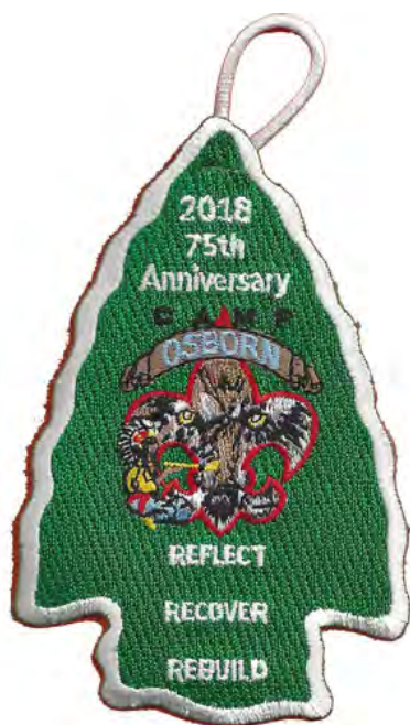
Given in 2018 to person who helped with the Workdays (Pocket Patch)