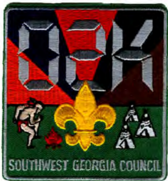
2000 Fundraising Patch