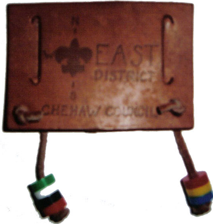
Circa 1970 Chehaw Council