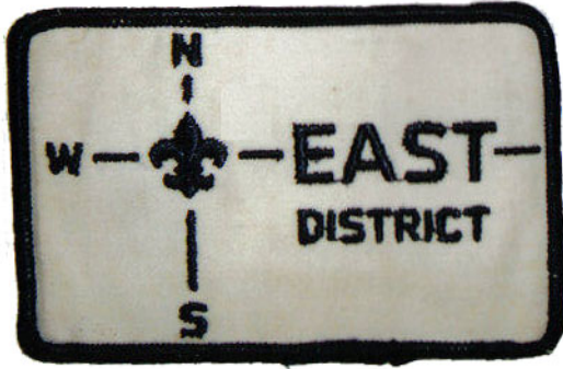
District Patch Circa 1970 Chehaw Council